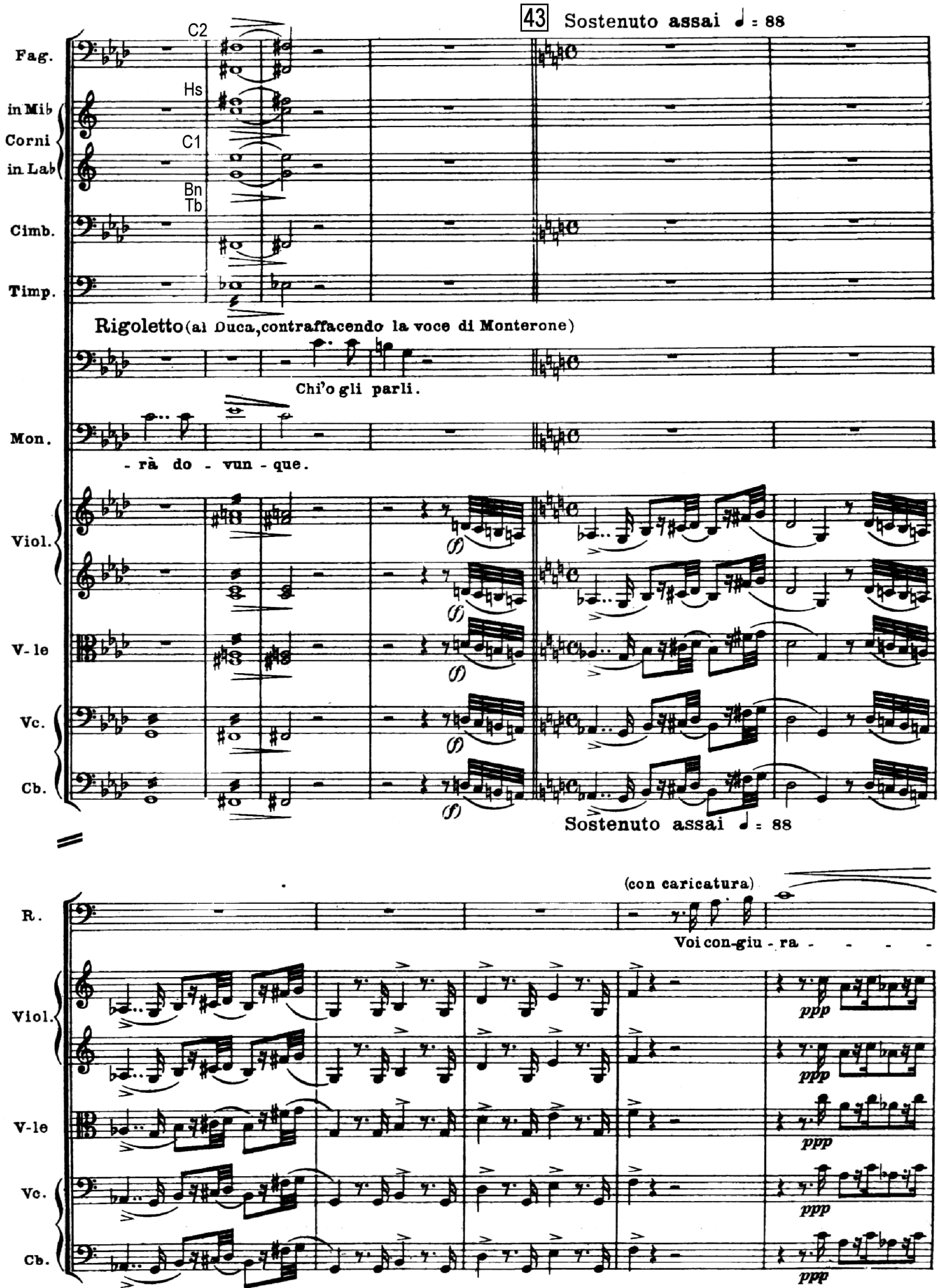
Act I \cdot Rigoletto \cdot N° 2