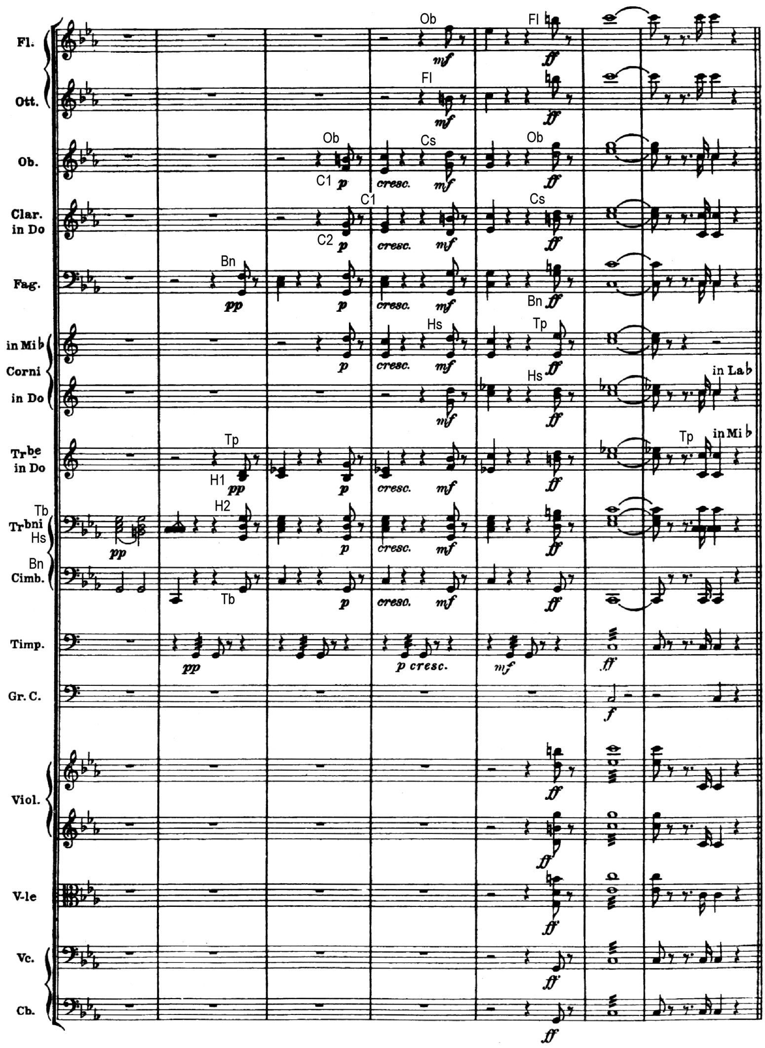
Act I · Rigoletto · Nº 1