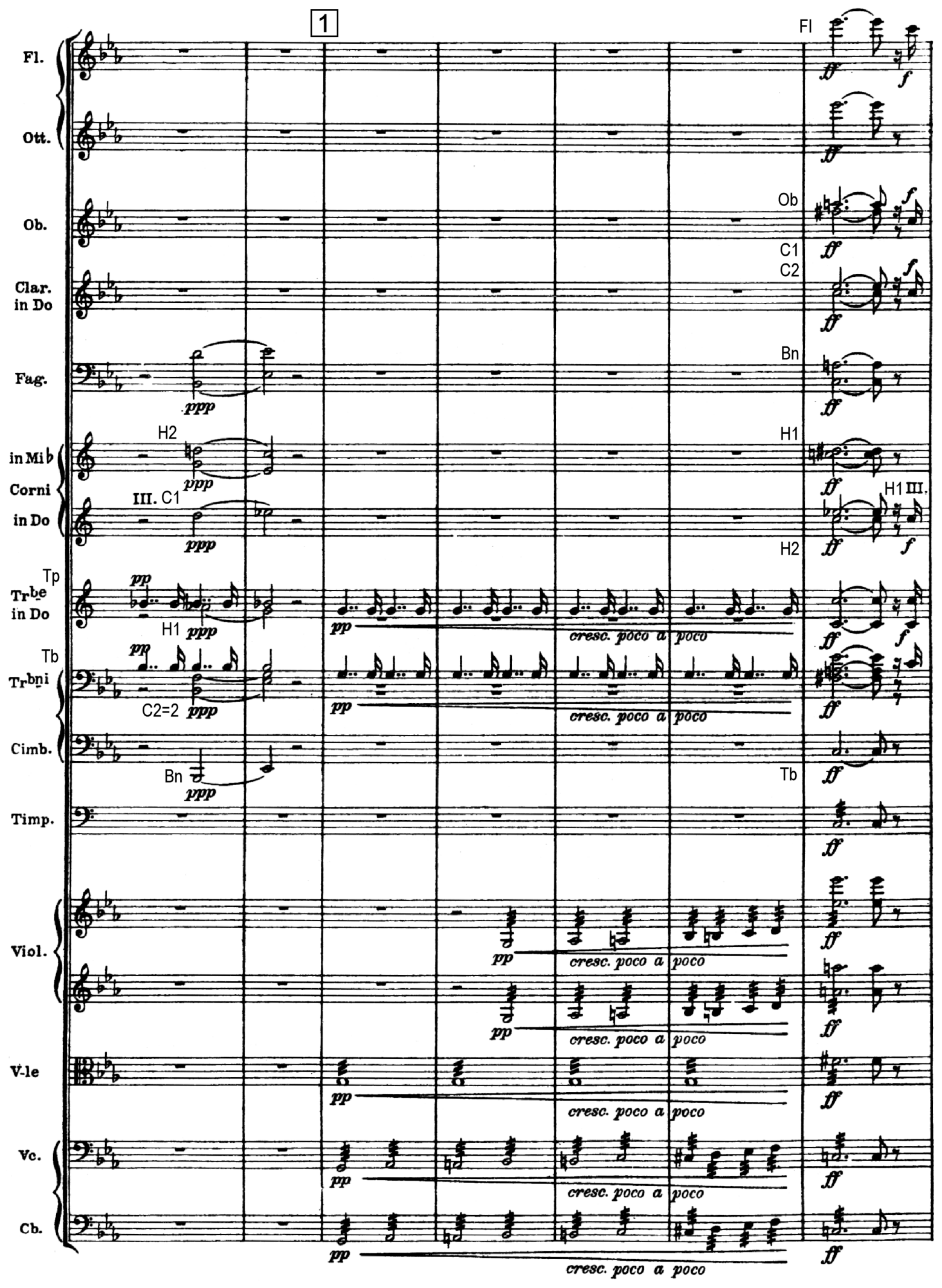
Act I · Rigoletto · Nº 1